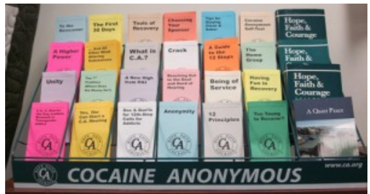
"New" 24 Pocket Literature Rack Rack, has pockets for 8 Books and 16 Literature Pamphlets "or" all 24 Pamphlets and space for 4 books.

Grand Total $ _____ Rounded Total $ _____